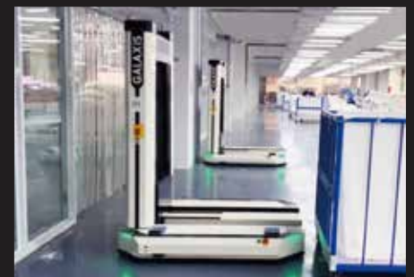
Fashion & Apparel